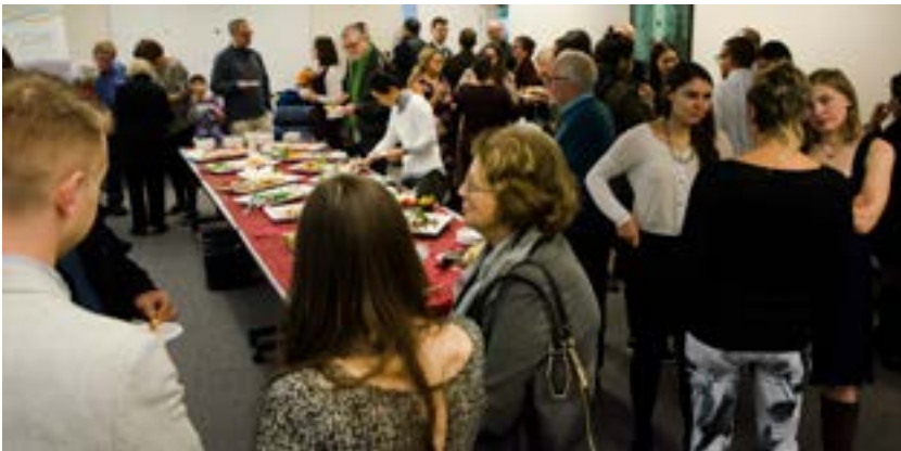
SCARP Graduation Reception: Class of 2017