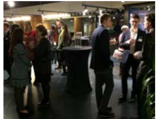
SCARP Internship Networking Event