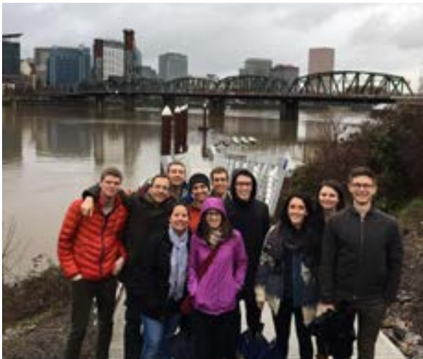
Annual Reading Week Trip to Portland, OR