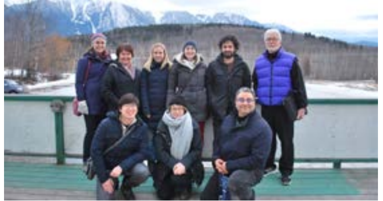
Second Year Studio: Hazelton Community Mobility Team and the Public Health Team