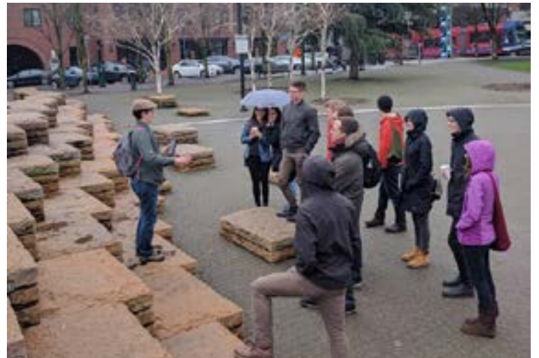
SCARP on tour with PSU's student association president in Portland, OR