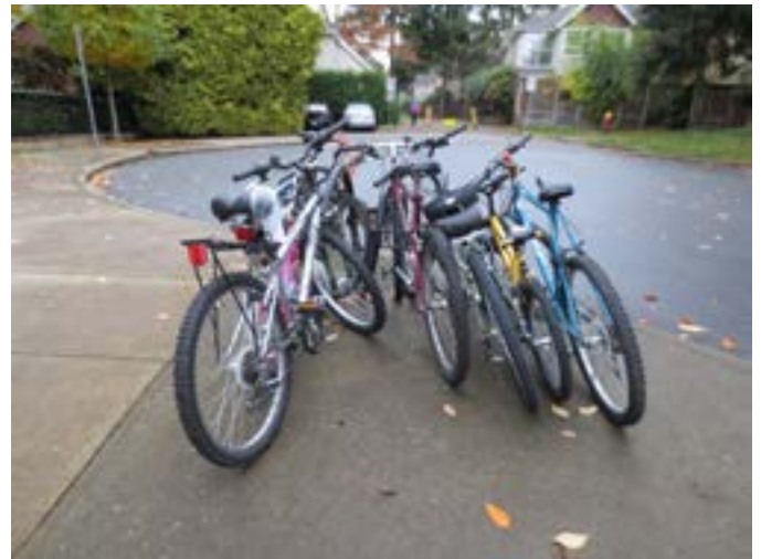
Crowded cycling infrastructure in Vancouver

Coming full circle from Cail Smith's undergraduate research into bicycle facilities, her capstone project with SEEDS focuses on bike parking in staff and private housing on campus. Working with SEEDS has allowed Smith to tap into the partner's connections across campus. The survey of residents will be available in English and Mandarin, beyond the scope of a typical graduate directed study. This will increase the accuracy of the the results significantly.