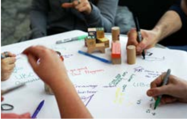
PLAN 595: facilitating World Cafe event with Campus Engagement