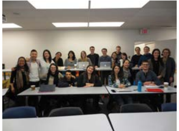
Class of PLAN 522

Alumni, faculty or staff interested in proposing projects can find out more about SEEDS on their website here .